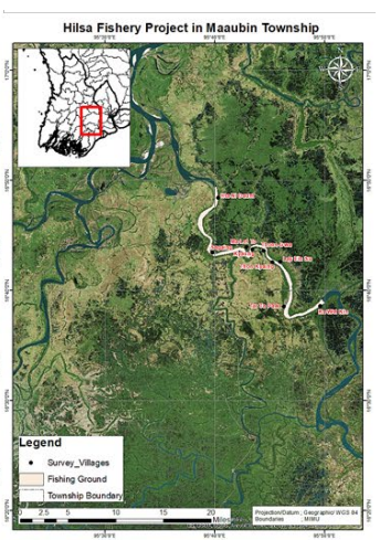
Figure 3 Household Participatory Rural Assessment (PRA) survey areas in the Ayeyarwady Delta coordinated by NAG to coincide with the spawning seasonality of hilsa using gonadosomatic index and assessment of hilsa migratory routes (Fig 1.)

The assessment of preferences using the choice experiment method and estimation of short-term economic costs (opportunity cost) are still pending but on schedule (to be completed by Q2 Y2).