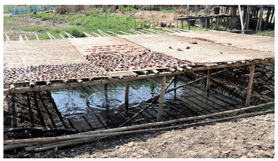
Figure 2 A micro-pond operated by a fisher household in Maubin, Ayeyarweady Delta. Fish from inland capture fisheries are gutted, headed and sun-dried. The waste goes to feed catfish in the shaded pond

micro-scale commercial aquaculture to offset reduced earnings from lower yields from inland and inshore capture fisheries – including the hilsa fishery. Some of the micro-ponds are as small as 15m2 and therefore do not require DoF pond licences (ponds below 58m2 are exempt). The ponds are dug by hand and abandoned when the monsoon rains flood them – an adaptation to climate change and increased storm frequencies (see Fig. 2).